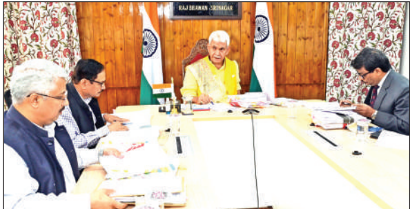
LG Manoj Sinha chairing Administrative Council meeting at Srinagar on Wednesday.

The installation of the vertical lift will connect the Mubarak Mandi Heritage Complex with Peerkho Station of Jammu Ropeway Project and other tourist/pilgrim places, providing a com-