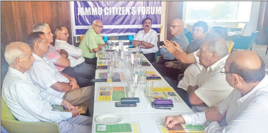
Members of Jammu Citizens Forum holding a meeting on Wednesday.

The Forum, at its meeting this afternoon, felt that the Jammu Power Distribution Corporation Limited (JPDC) must take consumers into confidence by expanding public outreach and clear the confusion on overbilling besides pre and postpaid tariff bills, especially in the wake of a significant segment of people either not being tech savvy or having no access to inter-