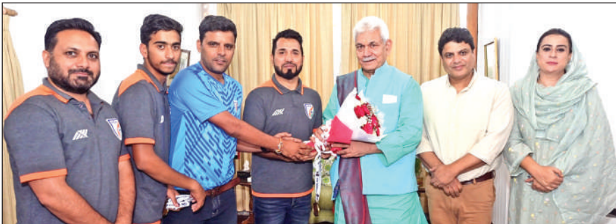
Winners of SAFF Under-16 Championship from Jammu Kashmir calling on Lt Governor Manoj Sinha on Wednesday.

SRINAGAR: The winners of South Asian Football Federation (SAFF) Under-16 Championship from Jammu Kashmir called on Lieutenant Governor Manoj Sinha on Wednesday.