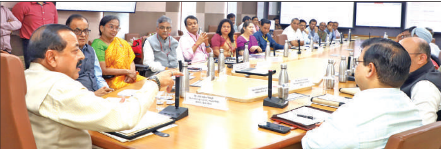
Union Minister Dr Jitendra Singh chairing a joint meeting of all the Science Secretaries at CSIR Science Centre, New Delhi on Wednesday.

The New Delhi Declaration was hailed for the promotion and collaboration of Science & Technology, particularly towards achieving the United Nations' Sustainable Development Goals (SDGs).