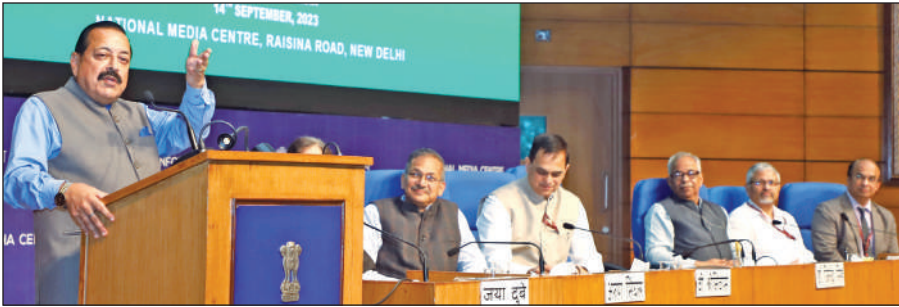
Union Minister Dr Jitendra Singh speaking after launching the dedicated Swachhata Special Campaign 3.0 Portal, at National Media Centre, New Delhi on Thursday.

■ STATE TIMES NEWS NEW DELHI: Union Minister, Dr Jitendra Singh on Thursday launched the "Swachhata Portal" for Swachhata Special Campaign 3.0, https://scdpn.nic.in , at a function here for monitoring of the Swachhata campaign. Dr Jitendra appealed to all citizens to join hands together; particularly the media in creating awareness. DARPG has launched a compendium of 300 Best Practices which will be implemented by all Government Ministries and Departments and published widely through media, highlighting 'Whole of Government' approach.