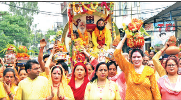
Devotees taking out Kalash Yatra at Jammu on Thursday.