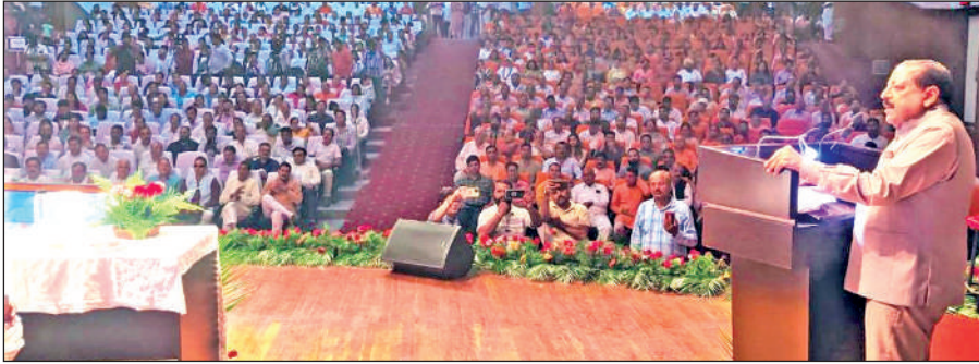
Union Minister Dr Jitendra Singh speaking during the launch of 'PM Vishwakarma' scheme at Jammu on Sunday.

Dr. Jitendra Singh was speaking here today during the launch of 'PM Vishwakarma' scheme by Prime Minister Narendra