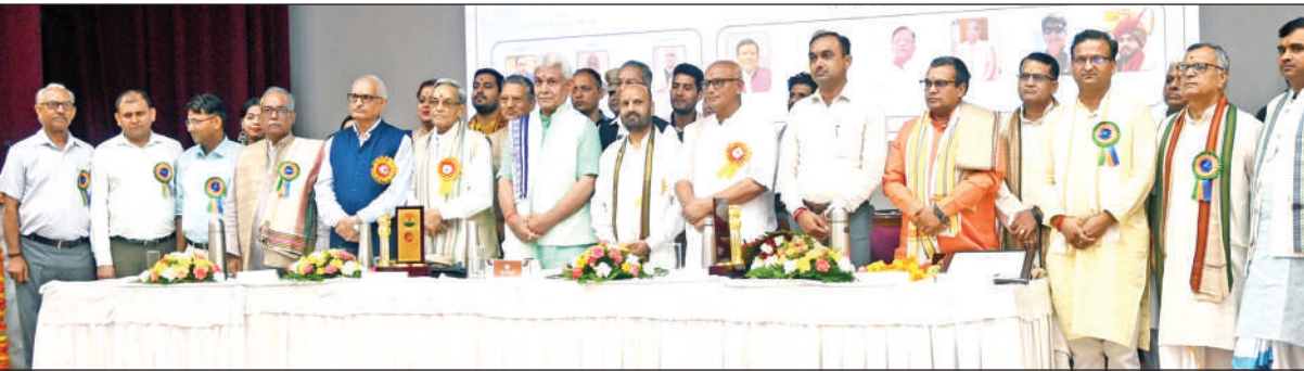
Lieutenant Governor Manoj Sinha at foundation day function of J&K Shri Kashi Vidwat Parishad, Jammu.

JAMMU: Lieutenant Governor Manoj Sinha on Wednesday described Amrit Kaal as the period of India's cultural renaissance, saying the entire World is watching us. "Every citizen must feel proud to be part of this journey and each one of us has equal opportunity to contribute so that our great country can regain its old glory of 'Vishwa Guru'," the Lt Governor said while addressing the foundation day function of J&K Shri Kashi Vidwat Parishad, Jammu.