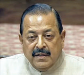
Union Minister Dr Jitendra Singh replying to a debate on Chandrayaan 3 Mission in Rajya Sabha.

NEW DELHI: Prime Minister Narendra Modi provided enabling leadership for Chandrayaan-3 and other Space missions with his foresight, increased allocation of funds and engaging private participation, said Dr Jitendra Singh, Union Minister. "We are offering them funds when they require it, we are offering them environment when they require it, we are offering them freedom when they require it, we are offering them synergy when they require it and we have liberated them from those self-imposed shackles and