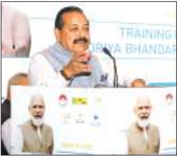
Union Minister Dr Jitendra Singh speaking after inaugurating a Training Programme for Kendriya Bhandar officials by IIM Raipur, at New Delhi on Friday.

Kendriya Bhandar is the first organization in India to seek institutionalised training for its