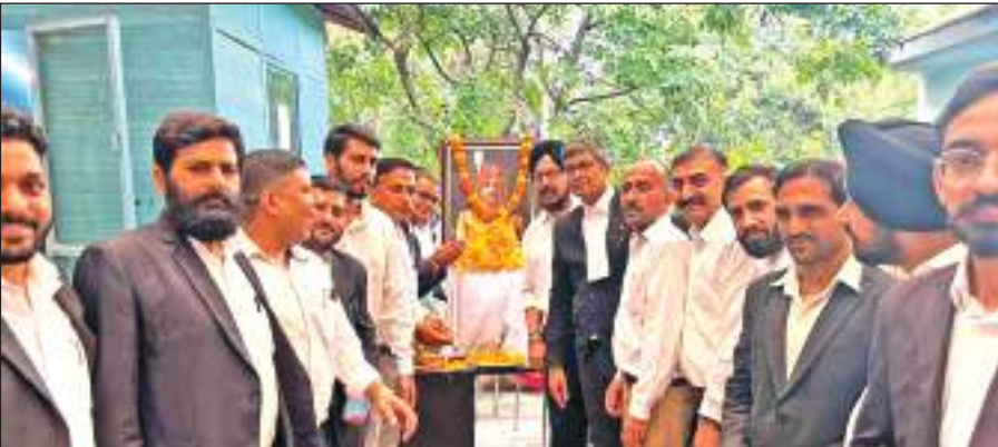
J&K High Court Bar Association, Jammu office bearers paying tributes to Maharaja Hari Singh on Friday.

He emphasized that Maharaja Hari Singh was a progressive and secular ruler and that the J&K High Court of Judicature