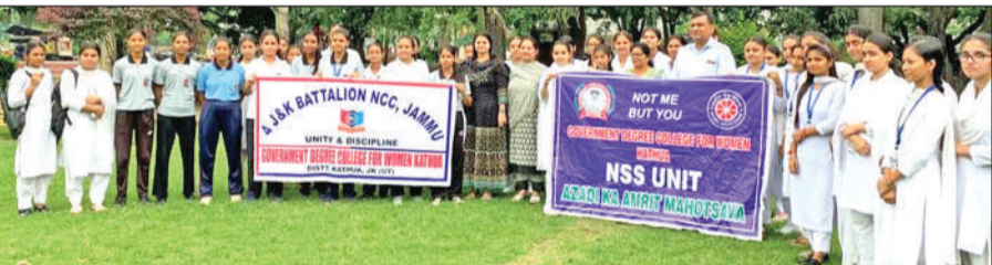
Students and faculty during cleanliness drive on Friday.