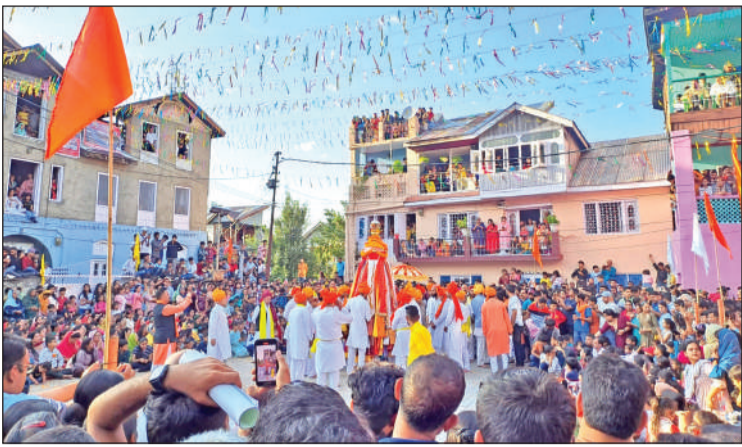
Devotees throng in large number at ancient Mela Patt.

The Mela was organized on the conclusion of the Kailash Yatra and peo-