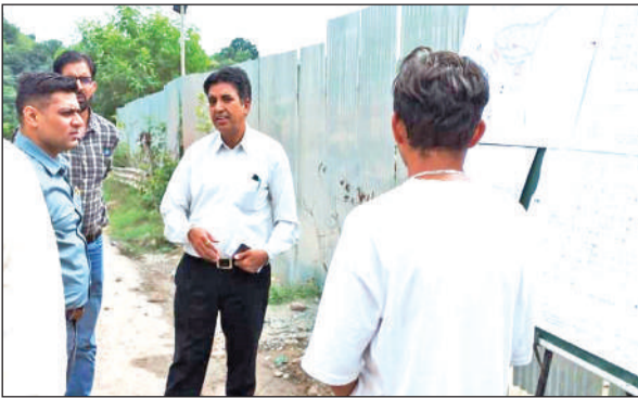
DC Rajouri, Vikas Kundal inspecting pace of progress of the Mother Child Care Hospital in Lamberi.

Situated on National Highway NH144A, Lamberi serves as a crucial geographic point, with easy accessibility from Rajouri, Kalakote, Sunderbani, Budhal, and Poonch. The hospital, with a total of three floors and an allotted cost of Rs 3.75 Crore, is anticipated to be completed by January 2026. Deputy Commissioner Vikas Kundal emphasized the importance of adhering to high-quality construction standards and urged the