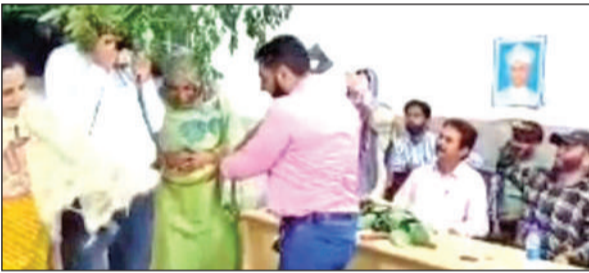
DIET Poonch officials at a programme.