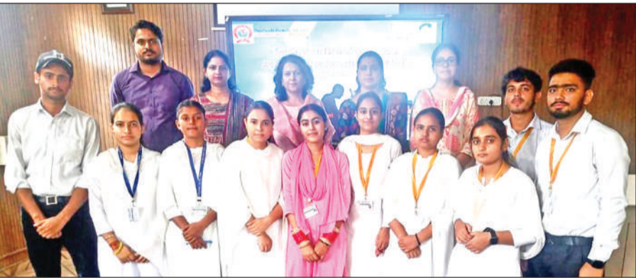
GDC Samba students and faculty members during a programme.