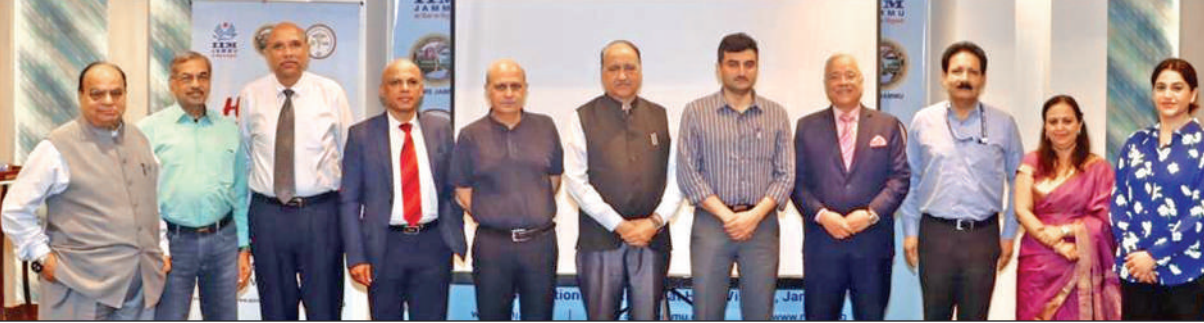
Panelists posing for a photograph on closing ceremony of 19th HXMDP at Jammu.

JAMMU: In a thought-provoking panel discussion on September 23, 2023, healthcare experts and law enforcement officials came together to address the pressing issue of violence against healthcare professionals in India. The discussion, held at the 19th HXMDP at Hotel Vivanta by AIIMS, Jammu, shed light on the gravity of the problem and outlined comprehensive recommendations to tackle this growing concern. A group of healthcare experts, law enforcement officials, and esteemed panelists gathered to address the alarming issue of violence against healthcare professionals in India.