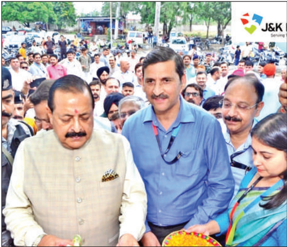
Union Minister Dr Jitendra Singh inaugurating J&K Bank's ATM at Kathua on Sunday.