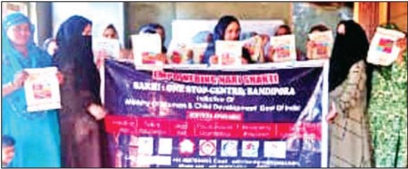
Distt administration start project on the occasion of Gandhi Jayanti.

■ STATE TIMES NEWS BANDIPORA: As a tribute to the ideals of Mahatma Gandhi, District Administration Bandipora in collaboration with JKSWM has launched a significant project "WASH (WOMEN AND SANITARY HYGIENE)" aimed at empowering women and fostering impeccable sanitary hygiene practices throughout the district. It was further given out that that in a first of its kind and unique initiative to promote Women And Sanitary Hygiene (WASH) in Bandipora, District Administration Bandipora and Jammu & Kashmir Students Welfare Mission (JKSWM), a non-profit organization, has embarked on a transformative journey. The initiative, supported by the 'We Are Human Foundation (WAHF)', New