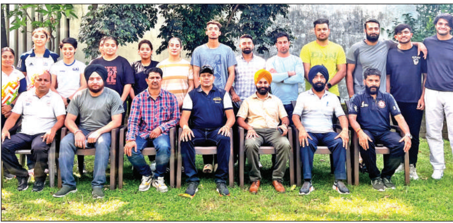
J and K officials along with team posing for photograph before departure.

■ STATE TIMES NEWS JAMMU: A 16-member Jammu and Kashmir team on Thursday left for participation in the Senior National Judo Championship scheduled to be held at Jaipur in Rajasthan from October one to October five. The team was accorded send off by the officials of Judo