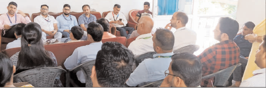
Admin and Bank officials during the meeting at Kathua.

■ STATE TIMES NEWS KATHUA: A sensitization meet for bankers of district Kathua was held at Kathua. The programme was attended by DDM, LDM, Kathua, and bank officials from different banks. On the occasion, DDM highlighted on the vision of the PM of India for making India a self-reliant Nation under Atmanirbhar Bharat. Accordingly, prioritised banking support, especially in agriculture & allied sector, MSME and, the rural economy to enhance