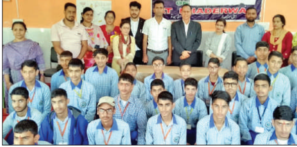
DLSA officials along with students during the event.