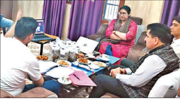
Committee members during the meeting at Doda.