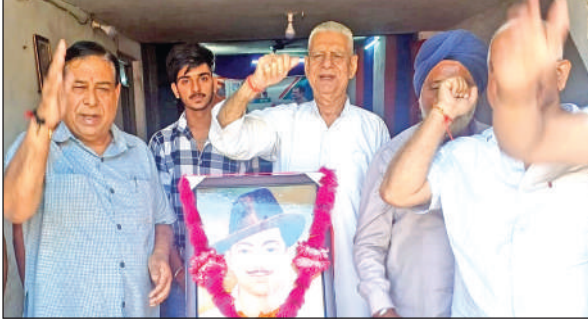
Congress workers paying tributes to Bhagat Singh.

■ STATE TIMES NEWS SUNDERBANI: Rich tributes were paid to Shaheed Bhagat Singh in a simple function at Sunderbani by the Congress workers on the occasion of his 116th birthday today.