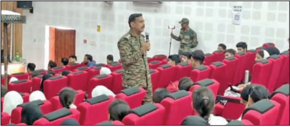
Army official addressing a seminar at Kishtwar.

■ STATE TIMES NEWS KISHTWAR: In its effort to reach out to the masses and spread awareness regarding prevention of substance abuse, Army, Dul alongwith team of Addiction Treatment Facility, District Kishtwar and Red Ribbon club of Government Degree College Kishtwar, organised a seminar on Mental well being and Prevention of substance abuse at Government Degree College, Kishtwar. The event was organised in a systematic way to drive home the point that youths involved in drug menace end up ruining their career and life. The event spread the awareness through innovative means such as skit on 'Nasha Mukht Kishtwar', Poster making competition and informative lecture by senior most Military Doctor of Batote based Military Hospital. Victims of drug abuse under rehabilitation also shared their experiences. The event witnessed an overwhelming response from youths and students of Government Degree College Kishtwar. Participants of Skit and Poster making competitions were felicitated with prizes. The efforts of Indian Army drew positive response from the populace & saw enthusiastic participation by the youths and students. The inhabitants have appreciated the efforts of Indian Army in sensitising the youth on Drug menace and its ill effects.