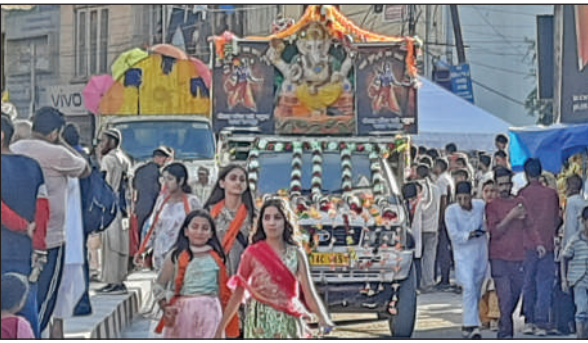
Devotees taking out Shobha Yatra at Udhampur.

■ STATE TIMES NEWS UDHAMPUR: Festival of Shree Krishna Janamashtmi was celebrated at different places in Udhampur with great gaiety. On this occasion number of social groups including Sanatan Dharam Sabha (SDS), ISKCON and local people participated in Shobha Yatra. Shoba Yatra was taken out from Chbutra Bazaar