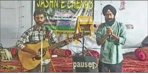
Artists performing during a programme.