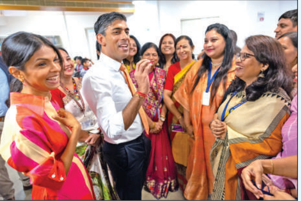
British Prime Minister Rishi Sunak interacting with staff of British Council.

After his arrival, he met students and staff at British Council here. "Before meeting the world leaders of today I've been meeting with the world leaders of tomorrow. It's been fantastic to visit students and staff here at @inBritish (British Council in India)