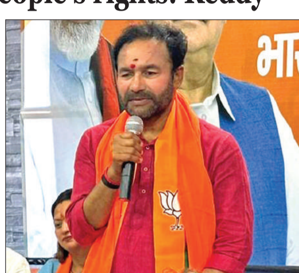
to the sacrifices made by leaders like Shyama Prasad Mukherjee, who gave their lives for the cause of "Ek Nishan, Ek Vidhan, Ek Pradhan" (One Flag, One Constitution, One Head). He noted that the 2019 abrogation of Article 370 marked a turning point in the BJP's