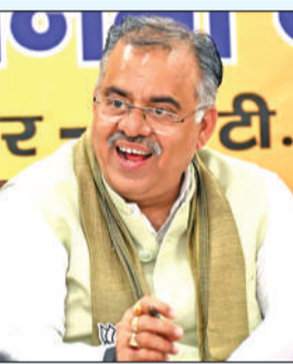
this; we need real results and sincere efforts." Chugh said it was "ironic" for them to seek to be seen as champions of unity. He added that

BJP won't allow NC, Congress to push J&K back into era of violence, bloodshed JAMMU: Bhartiya Janata Party (BJP) National General Secretary Tarun Chugh on Saturday said that National Conference (NC) and Congress are conspiring to push Jammu and Kashmir back to an era of violence, bloodshed and anarchy where people were denied their rights and youngsters were made to pelt stones and faced an uncertain future and were disillusioned. Addressing a joint meeting of party workers and leaders besides party candidates of eight assembly segments at BJP headquarter, Trikuta Nagar, Chugh said the manifesto of National Conference, over which Congress has maintained a criminal silence, says that it will bring controversial Article 370 back which means rights of West Pakistan refugees, women of Jammu and Kashmir, Valmiki samaj and Gorkha will again be snatched. The meeting was also addressed by former Deputy CM Kavinder