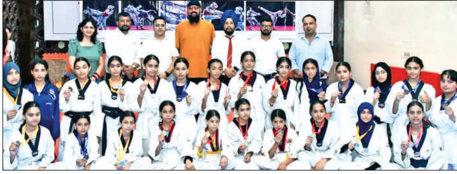
Poonch Taekwondo Girls along with officials of DYSS after winning overall Trophy of inter District Division level Taekwondo championship.

These victories have qualified the Gold medalists to represent Jammu division in the upcoming Inter-Division UT Level Taekwondo