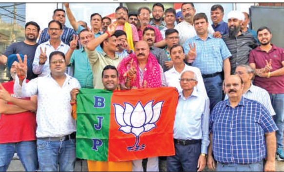
BJP leader and Assembly candidate for Jammu East, Yudhvir Sethi with traders at a programme.