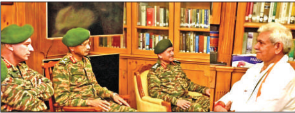
Chief of Army Staff, General Upendra Dwivedi meeting Lieutenant Governor Manoj Sinha at Raj Bhawan.