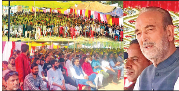
DPAP Chairman Ghulam Nabi Azad addressing a public gathering at Anantnag on Thursday.