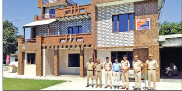
Police attaching property of drug peddler in Jammu.