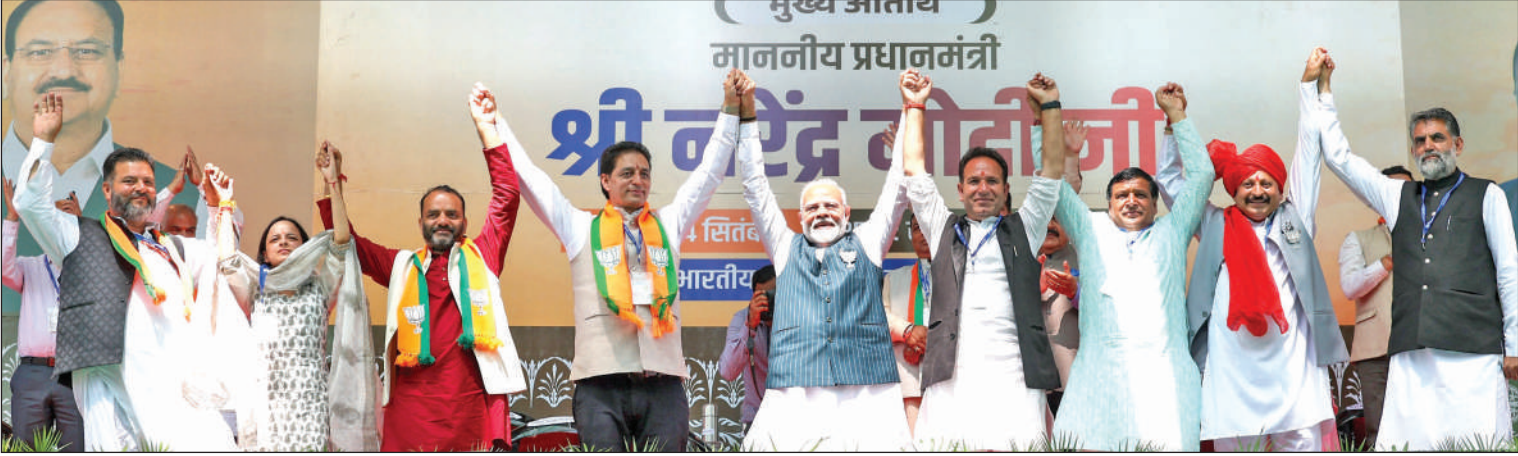
Prime Minister Narendra Modi along with senior BJP leaders and party candidates during election rally at Doda on Saturday.