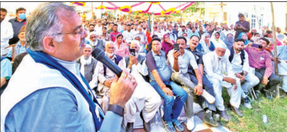
BJP National General Secretary Tarun Chugh addressing gathering at Surankote on Saturday.