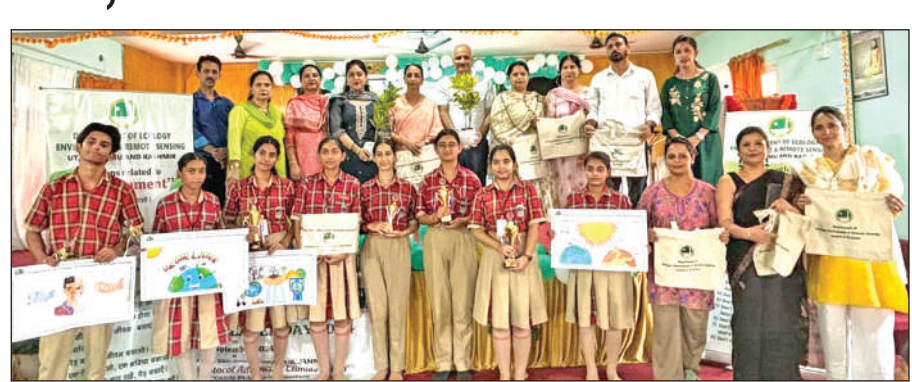
DEERS Jammu officials posing with students and faculty of Vishwa Bharati School.