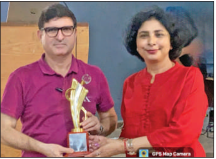
JU faculty felicitating a resource person.