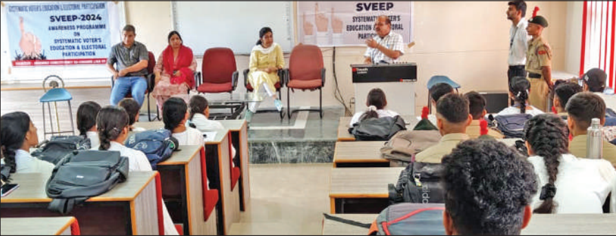
Faculty members speaking during a programme at GDC Khour.