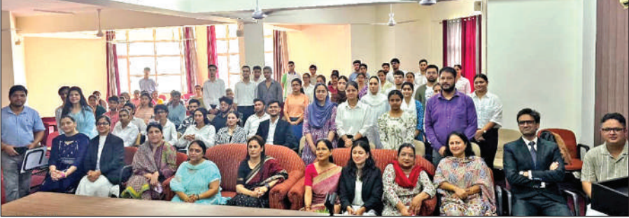
Faculty and students of The law School, University of Jammu at a programme.

After formal introduction by the newcomers and getting an idea regarding their motivations for pursuing a career in law, the first day of the induction ceremony commenced with an orientation on National Service Scheme (NSS), National Cadet Corps (NCC), and Bharat Scouts & Guides, led by experts like Prof.