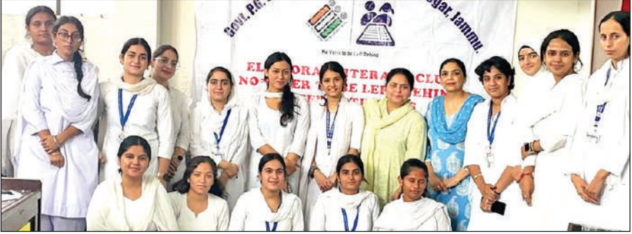
GCW Gandhi Nagar students and faculty at Quiz Competition.