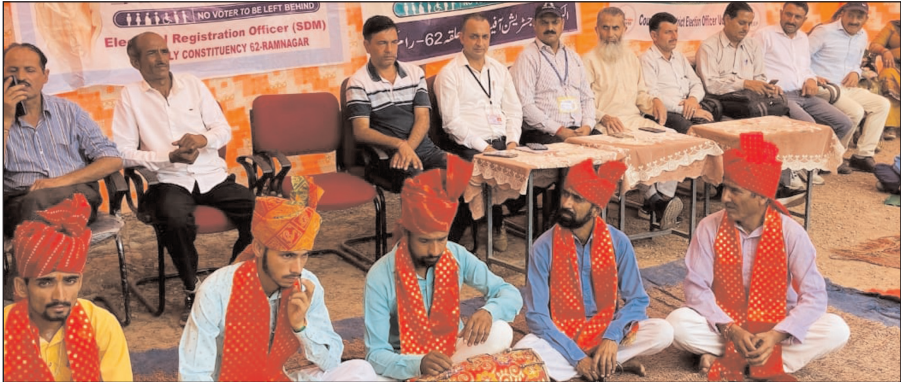
Dogri artists engaging the audience through performances at Kulwanta.