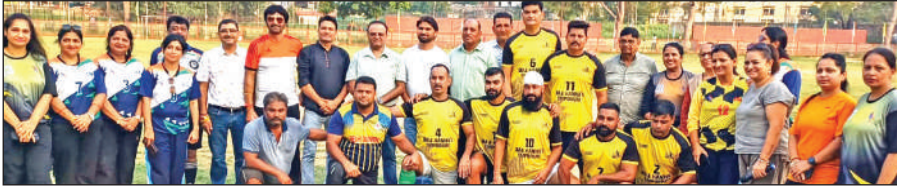
MFC team posing with dignitaries after winning the match.