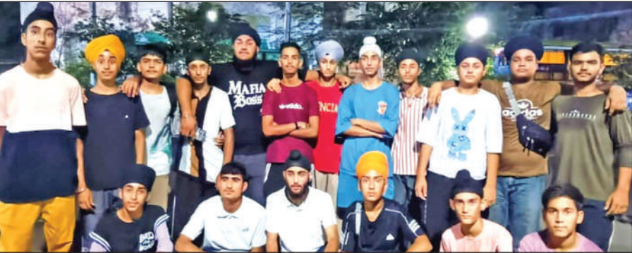
J&K hockey teams posing for photograph before leaving for nationals.