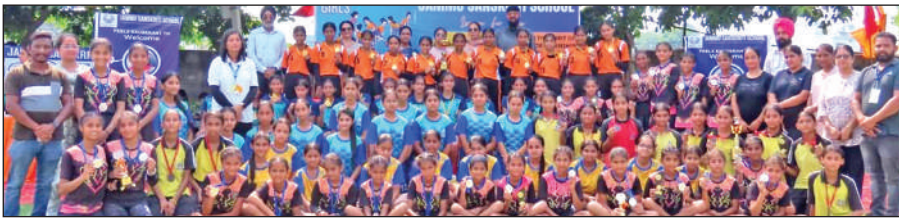
Participating teams posing for a photograph with dignitaries.