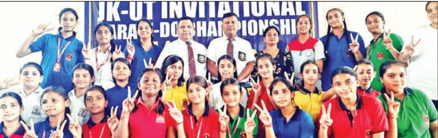
Medal winners posing for a photograph with officials.

He expressed hope that these recommendations would lead to effective solutions for the community's burning issues, reinforcing his commitment to advocating for local rights and transparency.