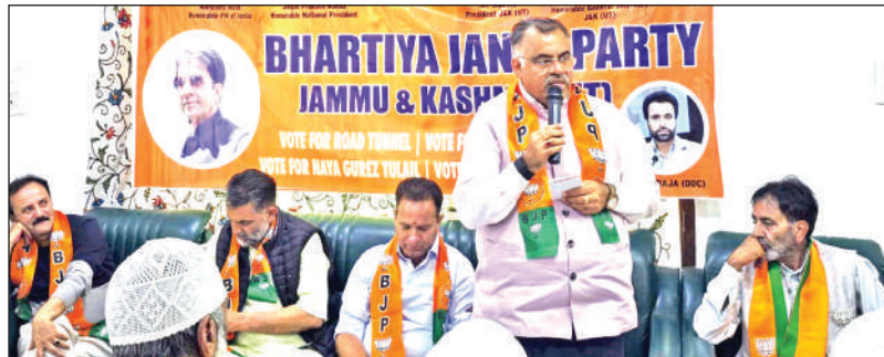
BJP National General Secretary Tarun Chugh addressing gathering at Srinagar.

given a new vision and optimism to the youth in J & K and soon there would be great results to see.