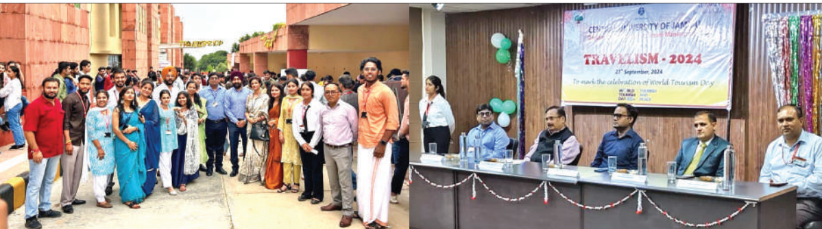
Faculty and students of TTM Department of CUJ during annual fest, Travelism-2024 to celebrate World Tourism Day.

■ STATE TIMES NEWS JAMMU: The Department of Tourism and Travel Management (TTM) of Central University of Jammu (CUJ) hosted its annual fest, Travelism-2024, to celebrate World Tourism Day. This year's theme, "Peace and Tourism," emphasized the integral role that tourism plays in fostering peace and unity across the globe.