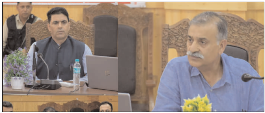
DEO Bandipora convening a review meeting on Wednesday.

BANDIPORA: The District Election Officer (DEO) Bandipora on Wednesday convened a review meeting at the Mini Secretariat, here to evaluate the poll preparedness for the upcoming assembly elections in the district. During the meeting, the DEO assessed preparations Assembly Constituency (AC) wise, receiving feedback from nodal officers on key elements, including welfare provisions, training, status of AC-level strong rooms, transport logistics, and SVEEP activities. The meeting also discussed counting arrangements, material management, and the functionality of the Media Certification and Monitoring Committee (MCMC) and control room. Returning Officers (ROs) of the three assembly con-