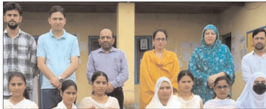
GDC Kastigarh students and faculty at voter awareness programme.