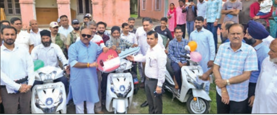
Deputy Chief Minister Surinder Choudhary distributing motorized tricycles among beneficiaries at Nowshera.

■ STATE TIMES NEWS NOWSHERA: Deputy Chief Minister Surinder Choudhary on Sunday chaired an awareness-cum-scooty distribution Camp in Nowshera. The camp aimed at empowering beneficiaries and promoting inclusive development in the region was organised by the Social Welfare Department. Addressing the gathering, Deputy Chief Minister stressed on the importance of impartiality in government offices and called upon officers to work with zeal and dedication to ensure prompt service delivery to the general public. He asserted on focusing collective development proposal submission than individual ones, assuring that developmental initiatives in the region would be taken up on priority basis.