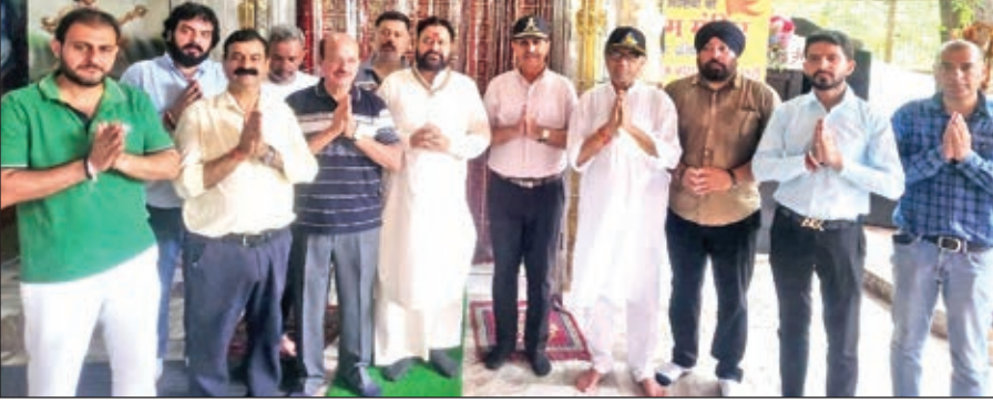
Gandhi Global Family members during distribution of relief among flood-hit people.

■ STATE TIMES NEWS JAMMU: In continuation of its humanitarian mission, Gandhi Global Family (GGF) reached out to the flood-affected families residing in Jogi Gate, New Company Bagh and Kabir Colony who have suffered heavy losses to their homes and livelihood due to the recent torrential rains. Volunteers of GGF, along with its Women Wing, distributed essential relief items including food packets, dry ration, sanitary products and other daily-use commodities to the affected families. The initiative was aimed at providing immediate relief to those who have been struggling to meet basic needs after the disaster. At Jogi Gate, the drive