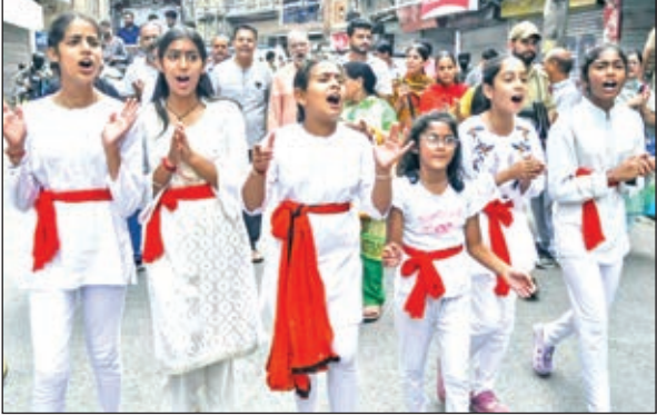
Kashmiri Pandits with children taking out a 'rath yatra' as part of Ganesh Chaturthi at Srinagar.