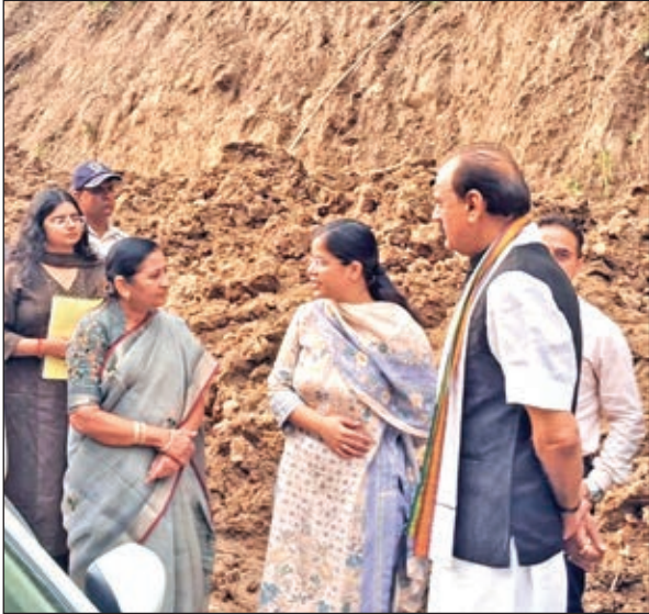
Union MoS for Consumer Affairs, Food & Public Distribution, Nimuben Jayantibhai Bambhaniya interacting with officials at Samba.

■ STATE TIMES NEWS SAMBA: Union Minister of State for Consumer Affairs, Food & Public Distribution, Nimuben Jayantibhai Bambhaniya, led an extensive field mission to Samba district today, personally supervising the massive relief and rehabilitation operations on ground. The high-level visit was marked by seamless political and administrative coordination, reflecting the government's resolve to safeguard every affected citizen. The Minister was accompanied by elected representatives including Surjit Singh Sathia, MLA Samba, along with Deputy Commissioner Samba, Ayushi Sudan (IAS), and Senior Superintendent of Police, Virender Singh Manhas (JKPS). Together, they formed a unified crisis management team operating under the Central Government's battle-tested disaster proto-