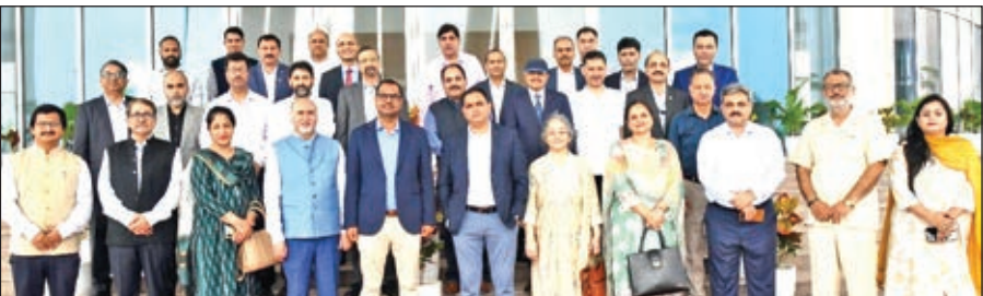
GMs & DGMs of J&K Bank with IIM Jammu faculty posing for a photograph.