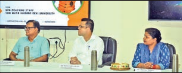
Non-teaching employees of SMVDU during a meeting.

This transformative move has been welcomed across the campus, symbolizing a significant step toward ensuring job security, dignity, and inclusive governance for all staff. The non-teaching staff conveyed their profound gratitude to the Lieutenant Governor of Jammu and Kashmir Union Territory and Chancellor of SMVDU, Manoj Sinha, for