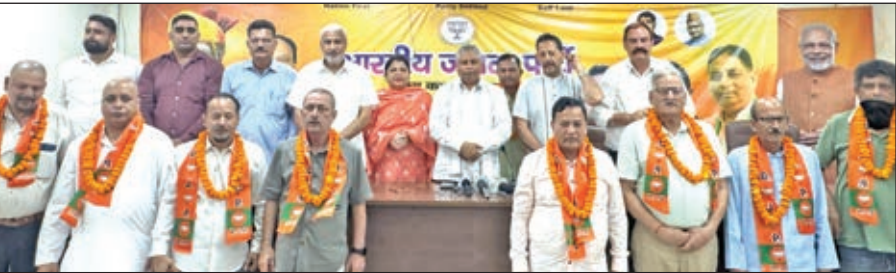
Newly joined members with BJP senior leaders at joining programme.