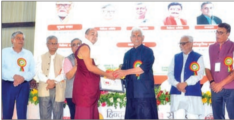
LG Manoj Sinha at the 'Bhartiya Bhasha Samagam' organised by Hindusthan Samachar Group at Varanasi on Saturday.

that under the leadership of the Prime Minister Narendra Modi, India is not only rising as a major economic power but is also reclaiming its past glory.