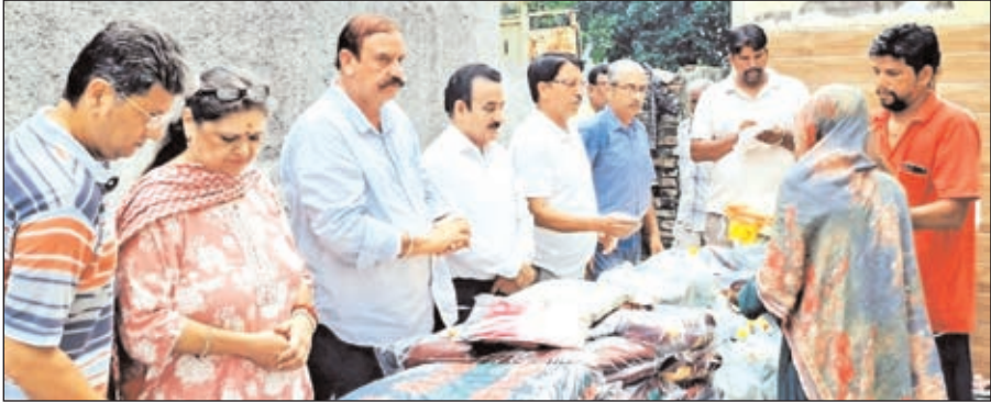
BJP Swachh Bharat Abhiyaan team distributing relief materials to flood affected families.

The relief materials, including blankets, clothing, food grains, sugar, tea packets, and cooking oil, were distributed among flood-affected families of Lower Harijan Mohallah,