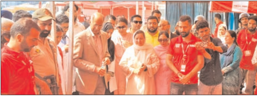
Health Minister, Sakeena Itoo at Blood Donation & Wellness Camp at Gindun Stadium Rajbagh.