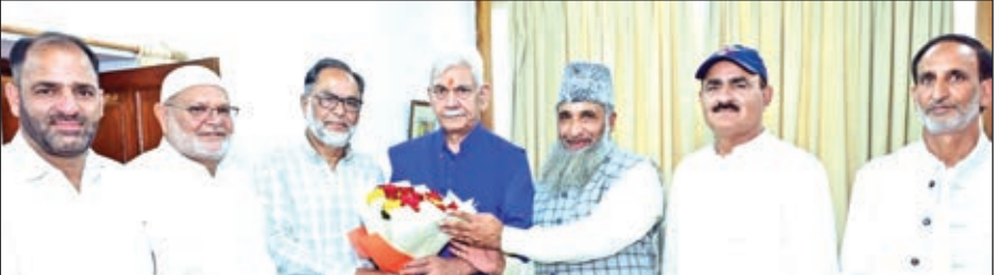
Kashmir Valley Fruit Growers-cum-Dealers Union members calling on LG Manoj Sinha.