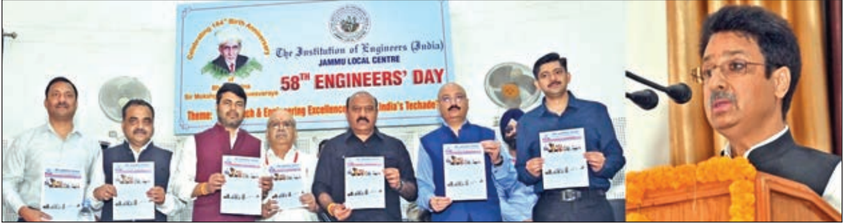
Deputy Chief Minister Surinder Choudhary and others at 58th Engineers Day celebrations.