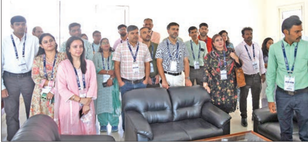
Participants of eleventh batch of Nurturing Future Leadership Programme at IIM Jammu campus.

He noted that the program serves as a valuable platform for peer