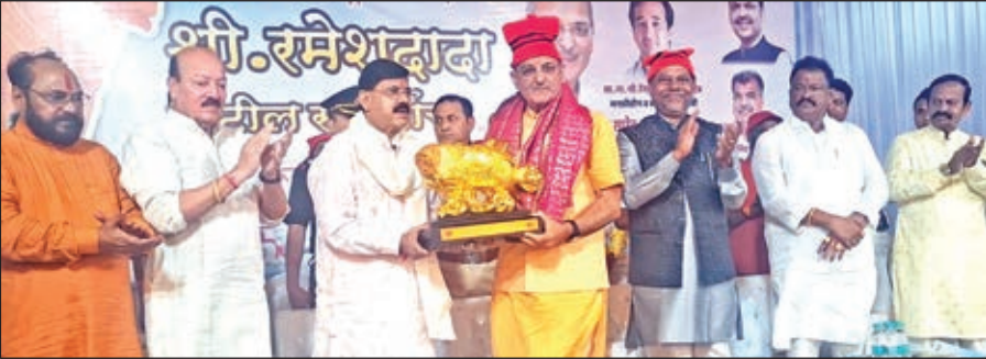
LG Ladakh, Kavinder Gupta being felicitated at function organised by Kohli Mahasangh Parivar Maharashtra in Navi Mumbai.

Drawing inspiration from the famous tourism campaign, the Lt Governor remarked, "Just as Amitabh Bachchan once said, 'Kuch Din Toh Guzariye Gujarat Mein,' I say today - 'Kuch Din Toh Aaiyein Ladakh Mein.'" The Lt Governor underlined that Ladakh is not just a destination, but an experience that stays with every vis-