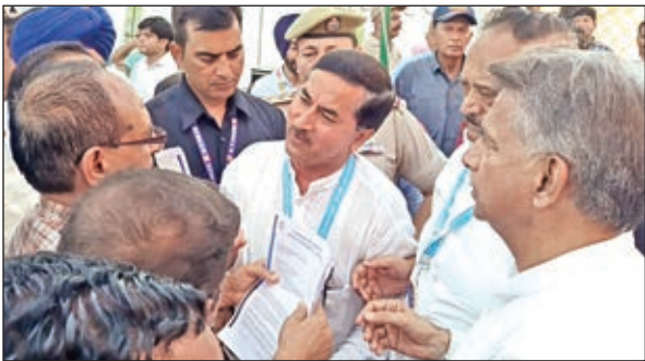
JKDFA members interacting with Union Agriculture Minister, Shivraj Singh Chouhan at Jammu.

During the extensive interaction that took place at the