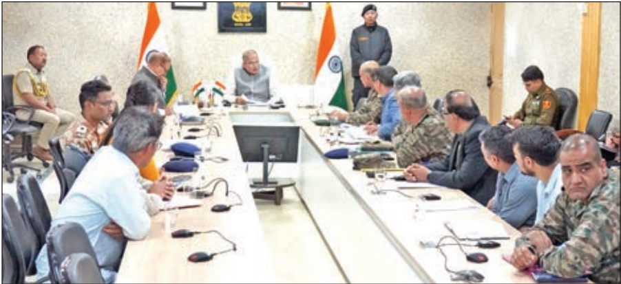
Lieutenant Governor of Ladakh, Kavinder Gupta chairing a meeting.

Emphasis was also placed on ensuring all sewage and wastewater be treated through Sewage Treatment Plants (STPs) as per envi-