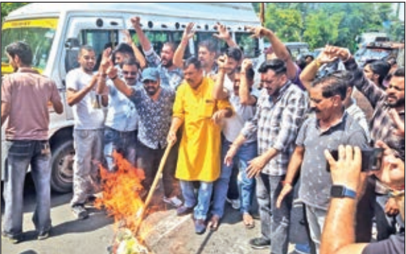
Rashtriya Bajrang Dal activists burning effigy during a protest at Jammu on Saturday.