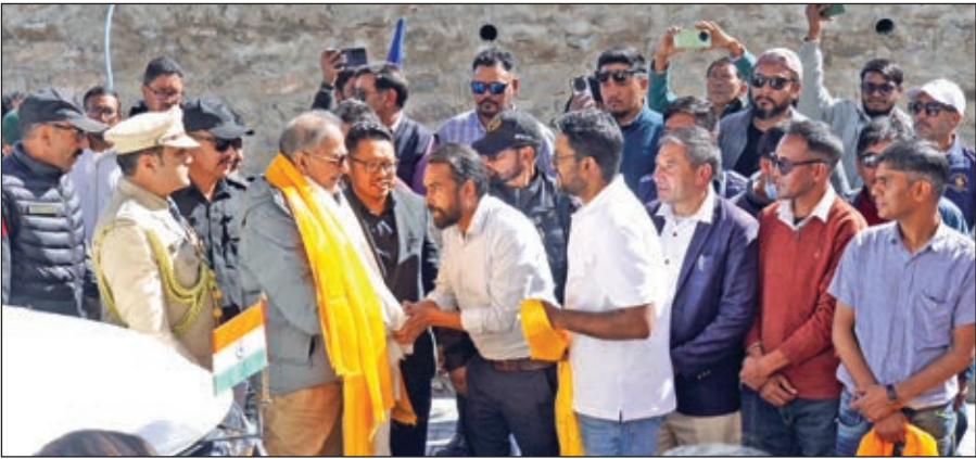
Lieutenant Governor Kavinder Gupta interacting with delegation members.