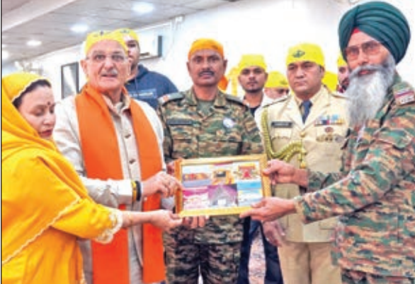
LG Ladakh, Kavinder Gupta, along with First Lady Bindu Gupta being honoured at Gurudwara Pathar Sahib.

The Lt Governor and Lady Governor offered prayers for peace, prosperity, and the well-being of the people of Ladakh and the nation. They also interacted with the Army personnel and lauded their efforts in preserving and maintaining the shrine with devotion and discipline.